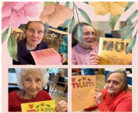
Happy Mother's Day!